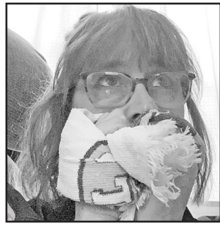
Record: 837-494-5 Season: 167-116-1