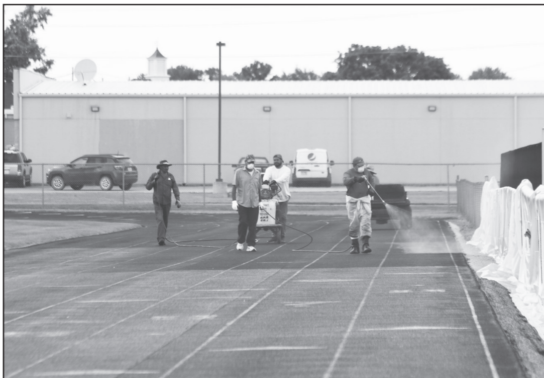
Midwest Tennis & Track out of Denison spent Monday, July 11, resurfacing the Red Oak track.