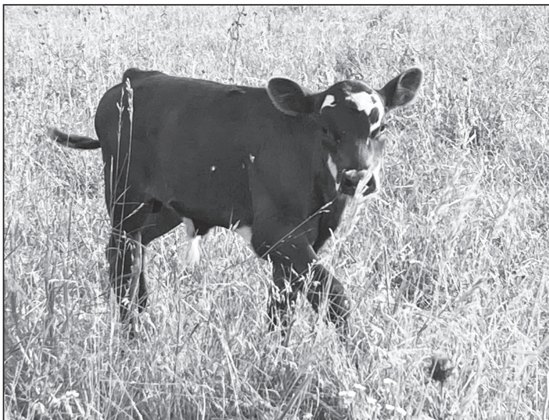
A crossbred spring calf walks through the tall grass on its way to get some water in rural Montgomery County.