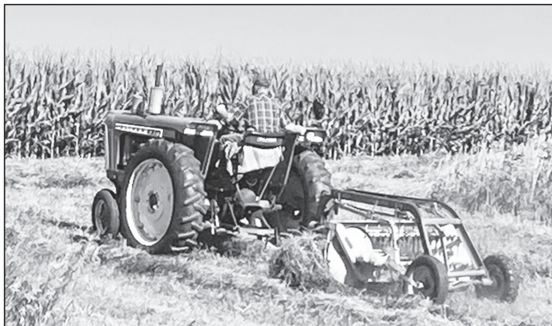
It has been a hot and dry July. Pictured is a farmer raking hay along Highway 48 near the Montgomery - Page County line last week.