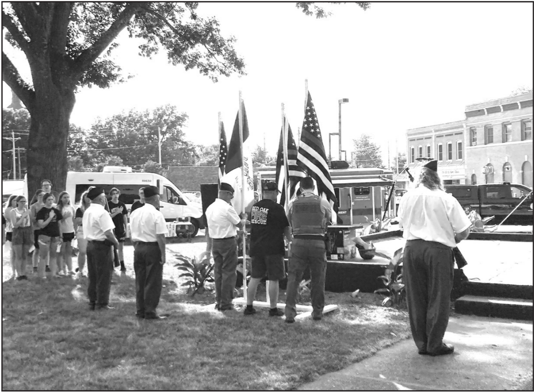
The sixth annual National Night Out in Red Oak took place Tuesday, Aug. 2, at Fountain Square Park. The event brought together first responders and the community for fellowship.